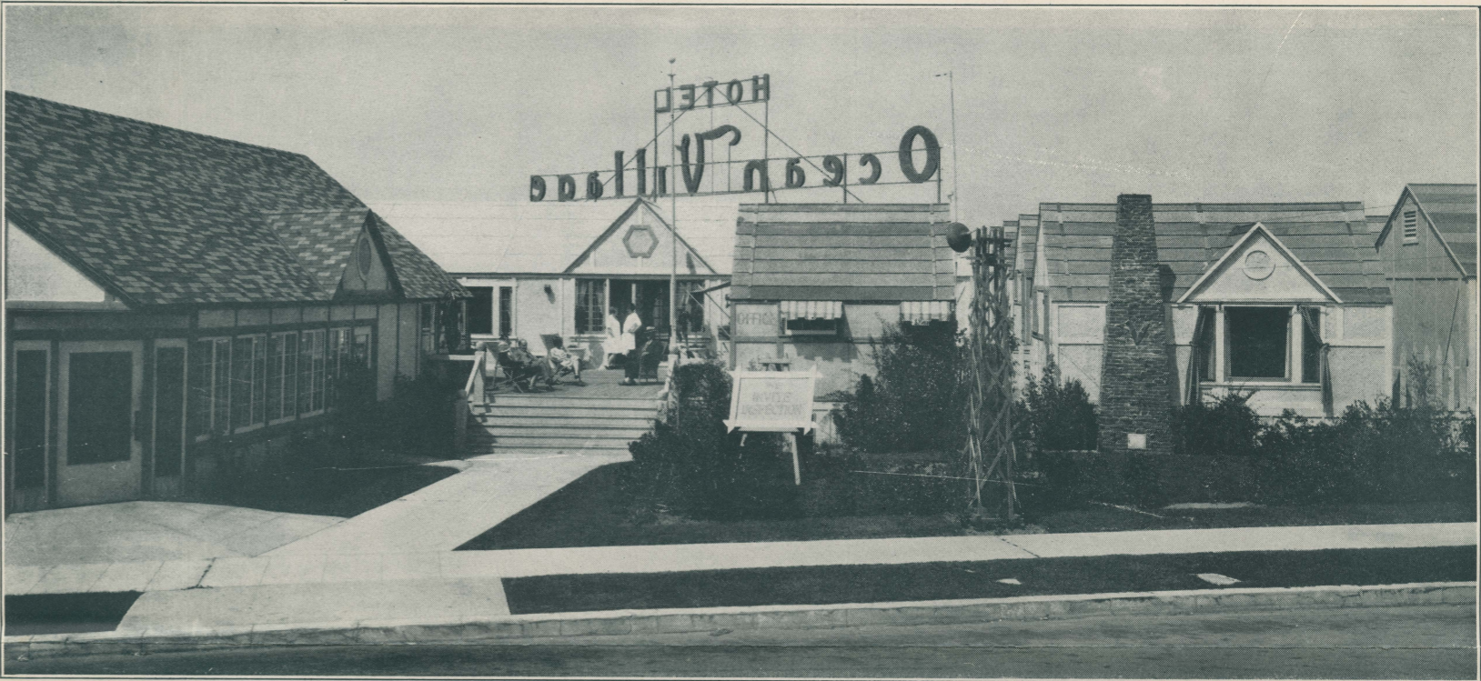
Above —Main entrance to Ocean Village, showing our Ocean Village Coffee Shop (to left), where excellent food is served at reasonable rates. A la carte service from 6 A. M. until 8 P. M.

An ideal winter and summer resort. San Diego enjoys the most equable climate on the Pacific Coast.