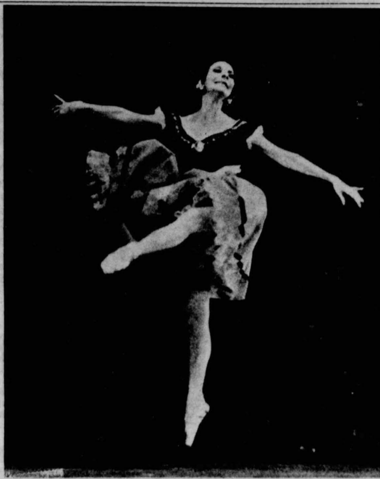
Alicia Alonso danced in last weekend's "Giselle" in front of a capacity audience at the Civic Theatre.

This is your Last Chance to give your views on Student Services. If you got a SOS - STUDENT OPINION SURVEY Please Complete It NOW!