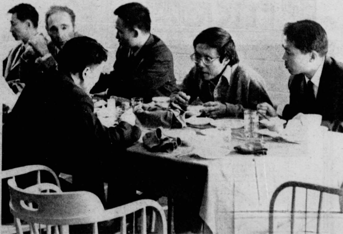
The Chinese Higher Education delegation which is presently visiting San Diego, dined with faculty and administrators on Monday.