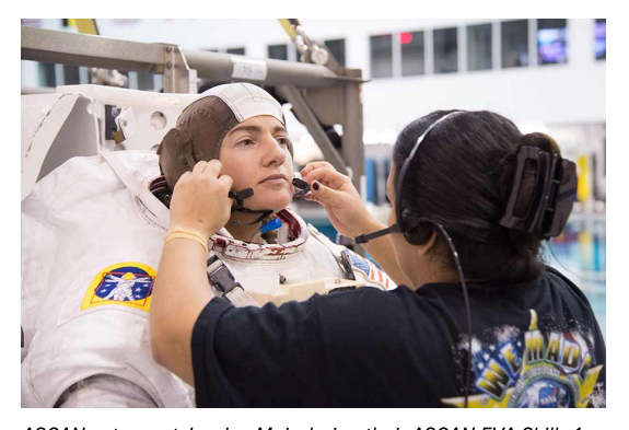
ASCAN astronaut Jessica Meir during their ASCAN EVA Skills 1 Training.

Cheers erupted as the rocket blasted off from the ground at 6:57 a.m. PDT, and again when it reached orbit.