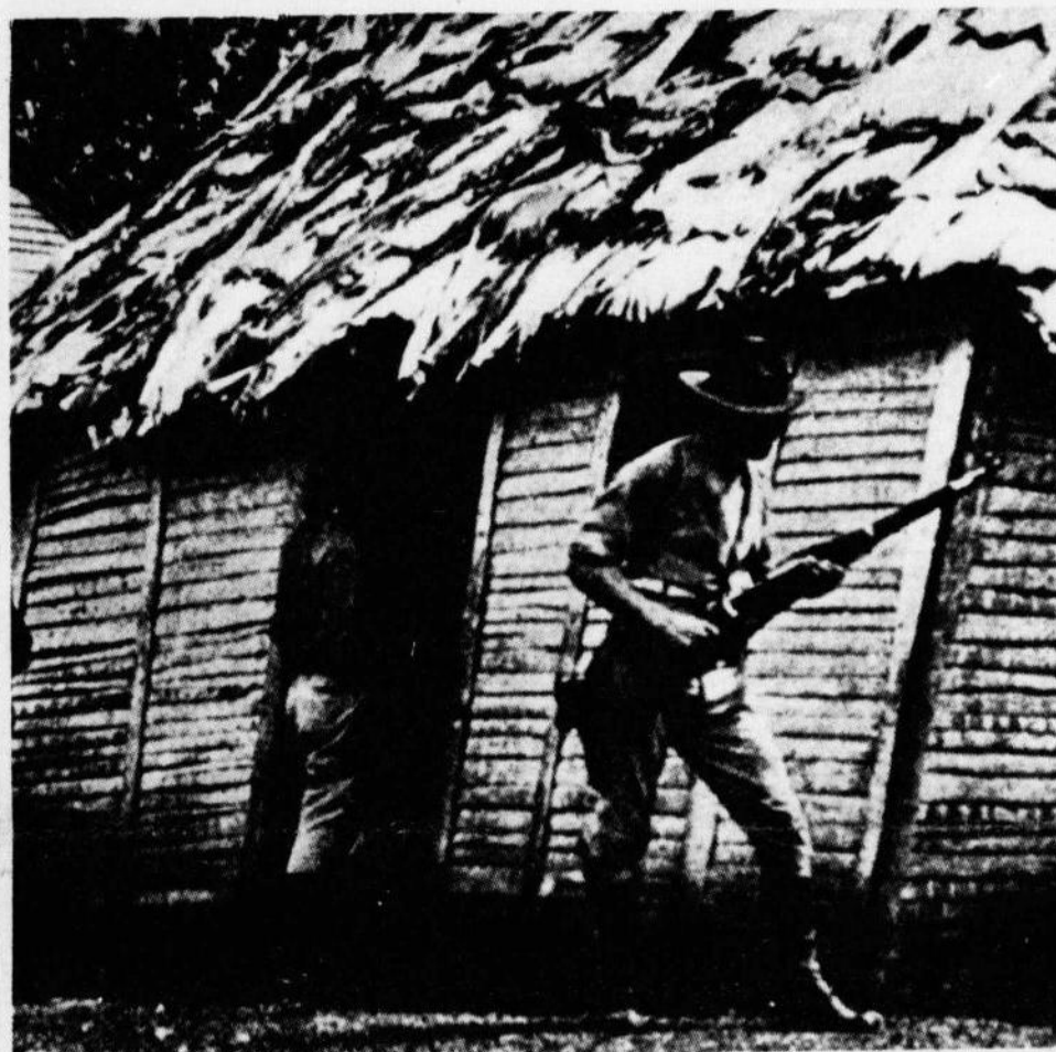
In defense of order?... Vietnam 1965, Dominican Republic 1917