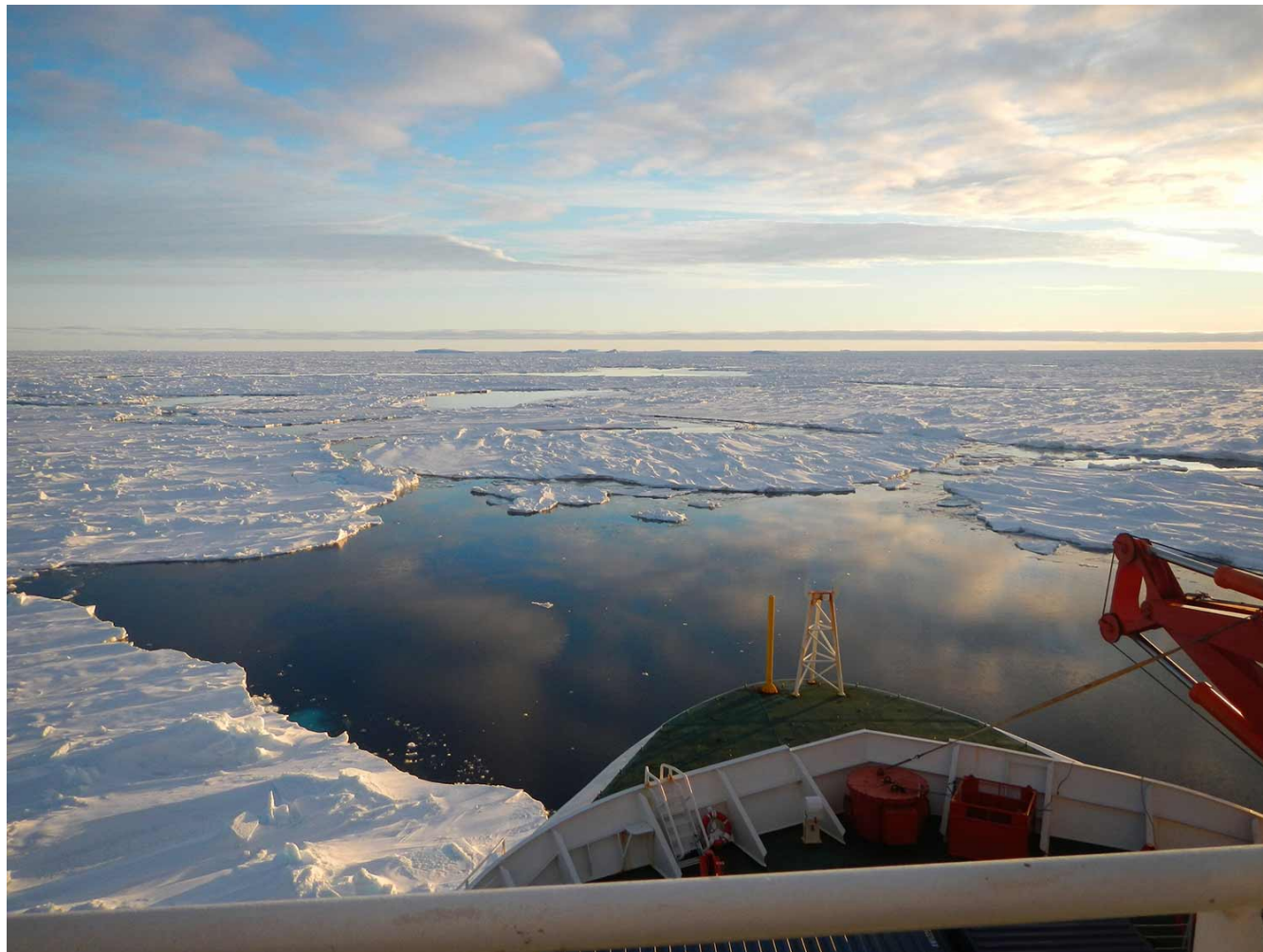
R/V Polarstern negotiates the Southern Ocean during SOCCOM.