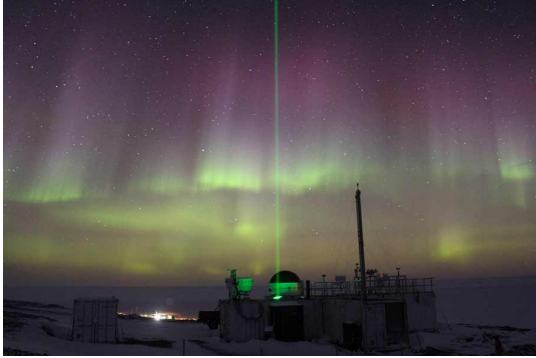
Aurora australis and a laser beam from the High Spectral Resolution Lidar (HSRL) at the AWARE climate observatory overlooking McMurdo Sound, Antarctica.

The authors of the report recommend increasing the spatial coverage of instrument networks and designing experiments that get at the causes of the phenomena that have been observed.