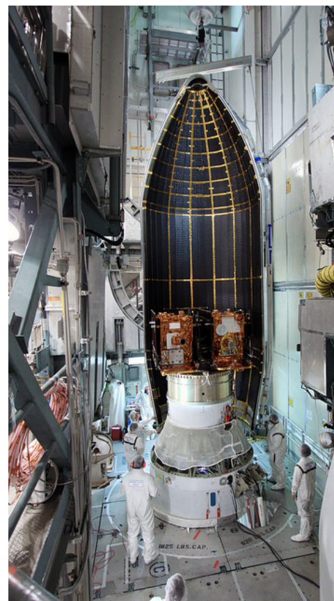
The GRAIL spacecraft before launch.

The MoonKAM project was inspired by EarthKAM, which takes pictures of our planet from the International Space Station. But it is more complex, Harrison said. On the space station, astronauts are available to troubleshoot if something goes wrong with the camera. But the GRAIL Spacecraft are unmanned, so everything needs to be automated.