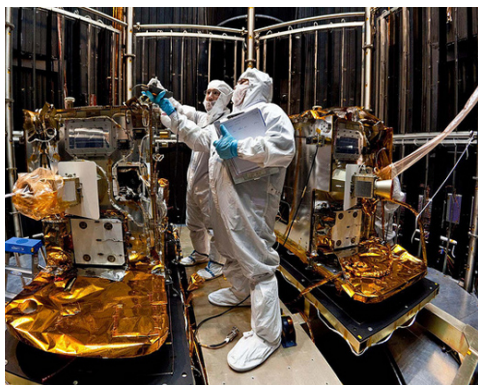
Technicians work on the GRAIL spacecraft before launch.