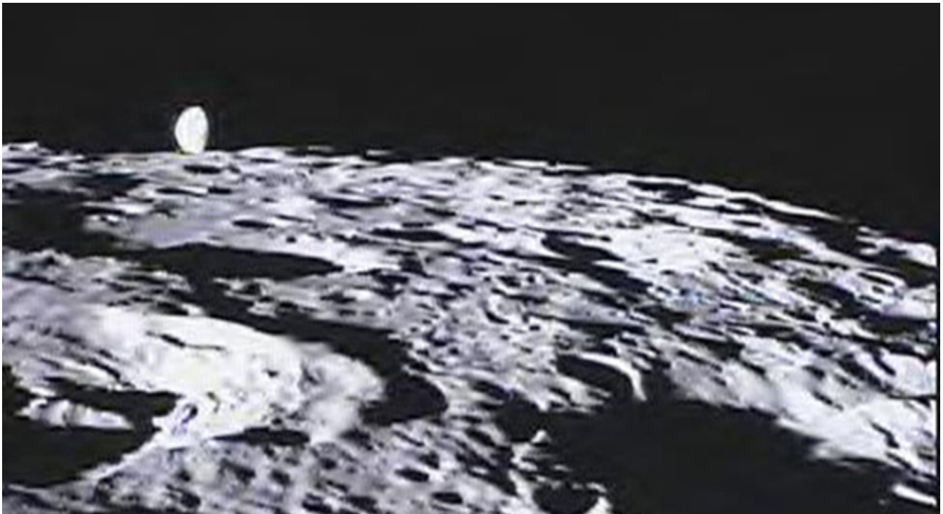
The earth rising over the moon, as captured by the MoonKAM cameras.

Undergraduates man mission that takes pictures of the moon at request of middle school students