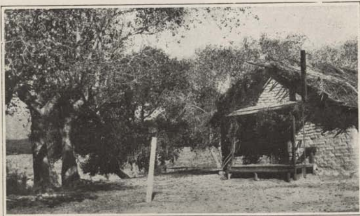
Old Indian Adobe

Warner Hot Springs are easy of access by all the railway systems and steamship lines in Southern California, which connect via San Diego by both stage and automobile from that city, affording a charming ride of a few hours through beautiful and constantly varying