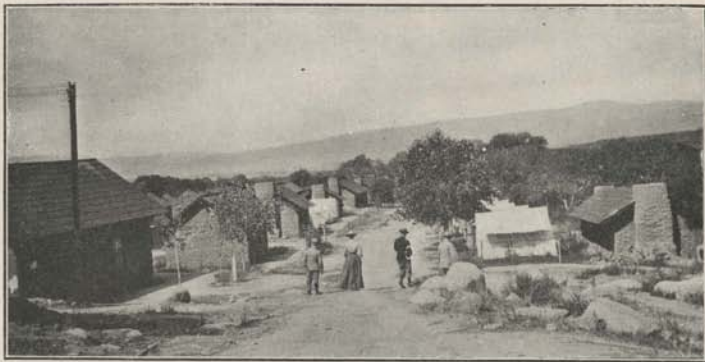
Old Indian Street, Still Preserved

minutes' walk westward from the Springs, stand out today in bold relief against the skyline. The southern gable is surmounted by the original crucifix, firm and erect as when first raised and consecrated by pious builders a century or more ago, braving the elements and, taken in connection with the edifice it adorns, beautiful in simplicity to the eye and grand in all that is represented to the imagination and the soul. The setting, too, of the picture is in perfect harmony and accord—circling mountains, fashioned in every imaginable way, lush pastures, undulating mesas stretching far and wide, seamed watercourses, and a happy blending of innumerable colors in the ocean haze. To view this wondrous landscape in "the incomparable pomp of eve" is alone well worth a visit to Warner Springs.