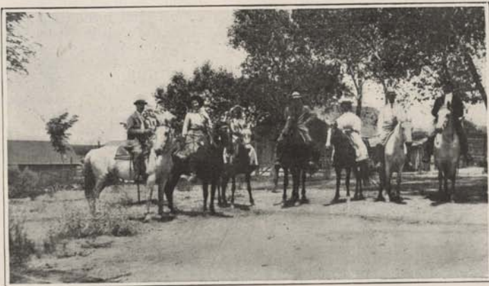
Off for the Summit

Analysis of the waters reveals a phenomenal collection of rare and valuable substances held in solution in exactly the right proportions, and this has been borne out by the thousands of complete and permanent cures. It may, therefore, be said in all truth that an intelligent course of treatment at Warner Hot Springs will result in a positive cure of all stomach, liver, kidney and blood