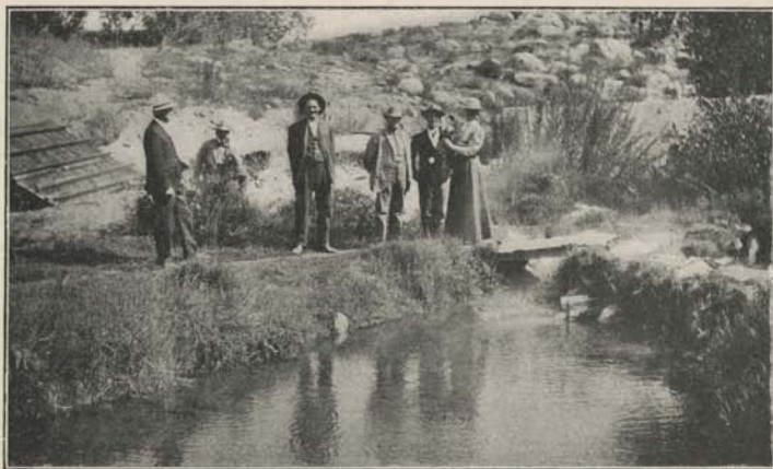
A Warner's Mineral Spring. Temperature 148 Degrees

brutality and torture on all sides. The Springs, as no other waters and conditions in all western Spanish-America, were well worth fighting for; but today they are open to the general public, and it may be said, in all sincerity, that of all the blessings and benefits with which this part of the world is so bountifully endowed, there is none of greater impor-