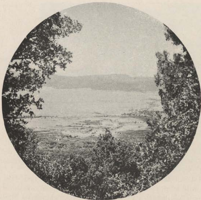
View of 47,000 acre Warner Ranch from elevation 5,500 feet (Eagle's Nest)