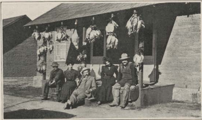
Results of One Day's Hunt

A first-class dairy and farmery is conducted in connection with the Springs, thus affording the freshest and best of cream, butter, poultry, eggs and vegetables and fruit in great variety—all of which is served to guests in generous abundance. An ice plant, the only one in the mountainous districts of Southern California, is also maintained here.