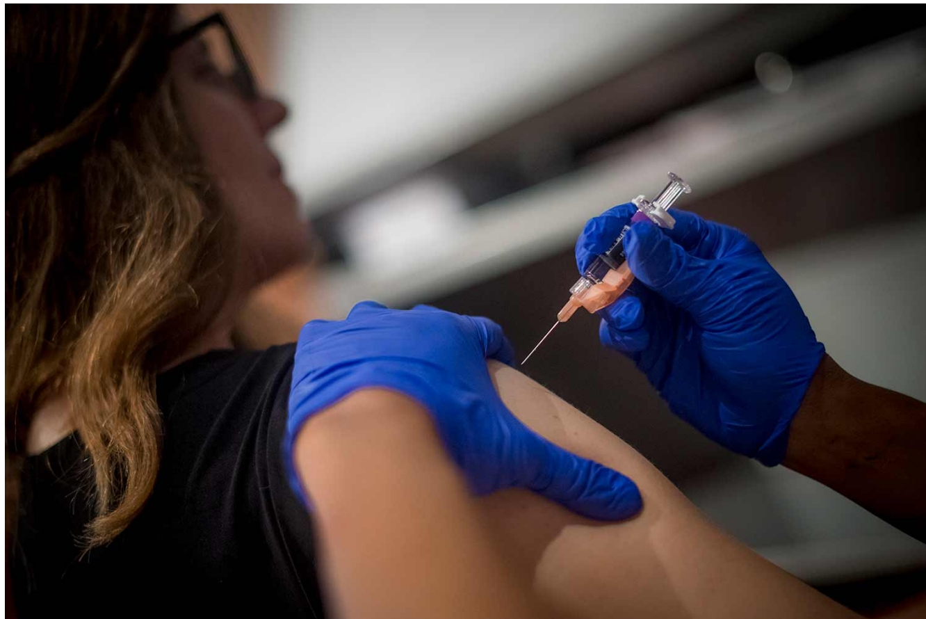
A UC San Diego Health employee receives a flu vaccination at the flu and hepatitis A drive.