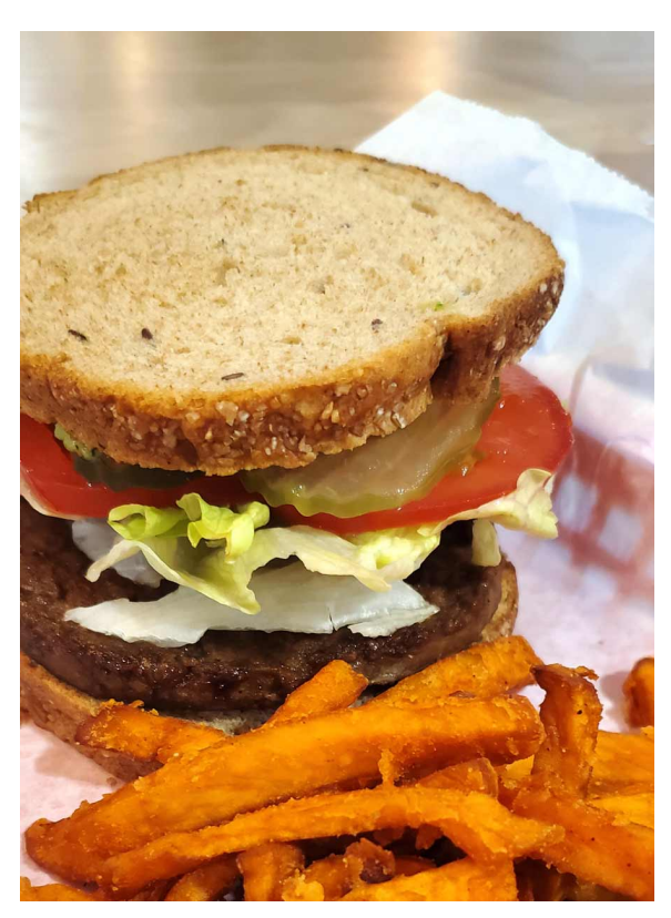
A black bean burger with sweet potato fries from the Fusion Grill