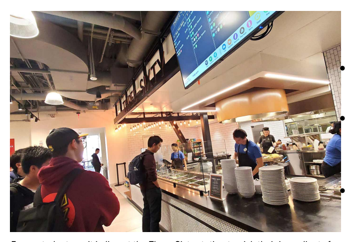
Eager students wait in line at the Three Sixty station to pick their ingredients for their made-to-order Mongolian-style bowls

As the first location on campus to combine a market and restaurant in one convenient location, Canyon Vista aims to be a healthy, one-stop shop. Earl's, a market formerly located on the second floor, is now incorporated into the layout of the marketplace. Students can pick up living essentials and groceries at the same time as their lunch. The space formerly occupied by Earl's now serves as home to the J. Kevin Wood Lounge, named for a Resident Dean (now referred to as Director of Residence Life) of Warren College from 1986 to 1992. With a staircase connecting the two levels, the facility offers students more study and lounge space.