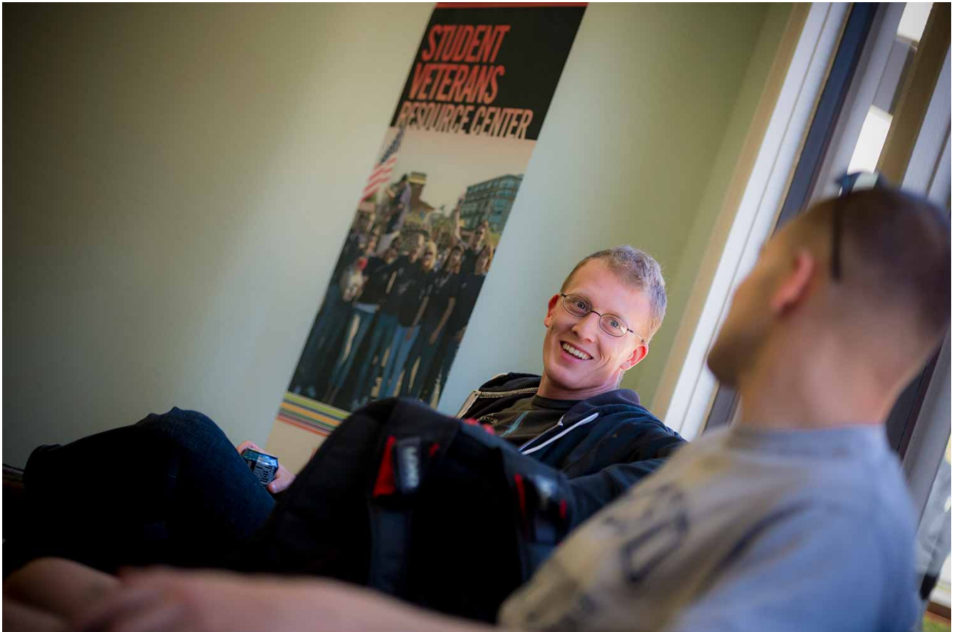
Student Veterans Resource Center.