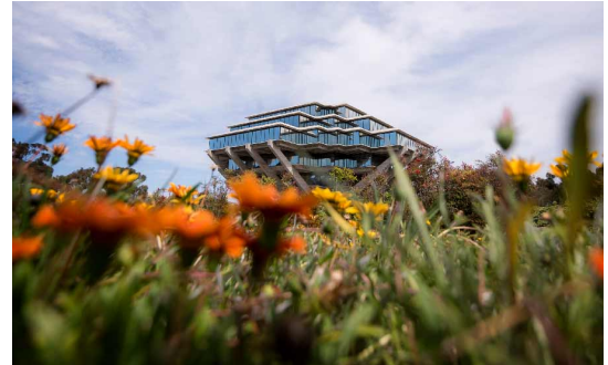
With a goal of raising $2 billion, the Campaign for UC San Diego is the most ambitious fundraising effort in the university's history.