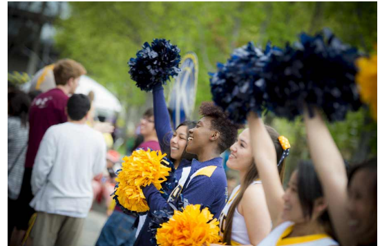
Private support will help UC San Diego enhance the student experience, enrich the campus community and spark research and innovation.