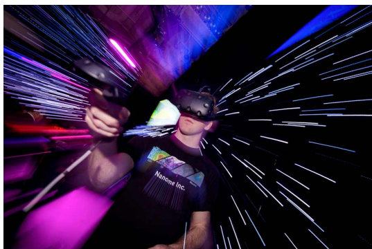
Guests at the Campaign for UC San Diego launch celebration were awed by a dynamic multimedia experience showcasing campus innovation and experimentation.