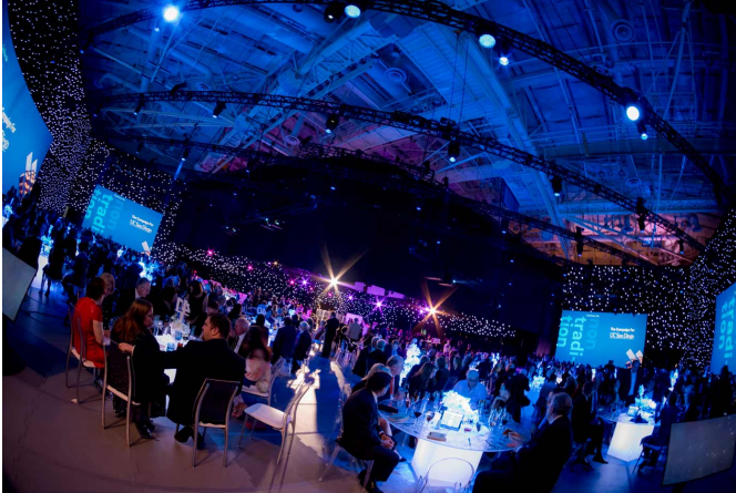
On March 25, more than 600 guests celebrated the public launch of the Campaign for UC San Diego.

“I actually thought about doing this anonymously,” he said about his gift to establish the institute. “I had to come to terms with this gift, and the publicity it would bring. I’ve always been under the radar. What are my students going to think? Maybe it will be inspirational.”