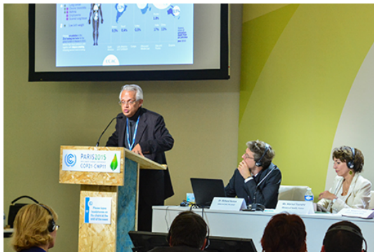
A delegation of Scripps researchers traveled to the Paris climate summit two months after last October’s UC Carbon and Climate Neutrality Summit.