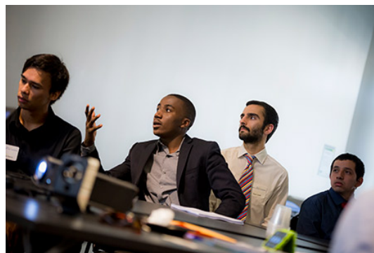
More than 370 undergraduates will have the opportunity to present their work to peers and the public through faculty-moderated panels.