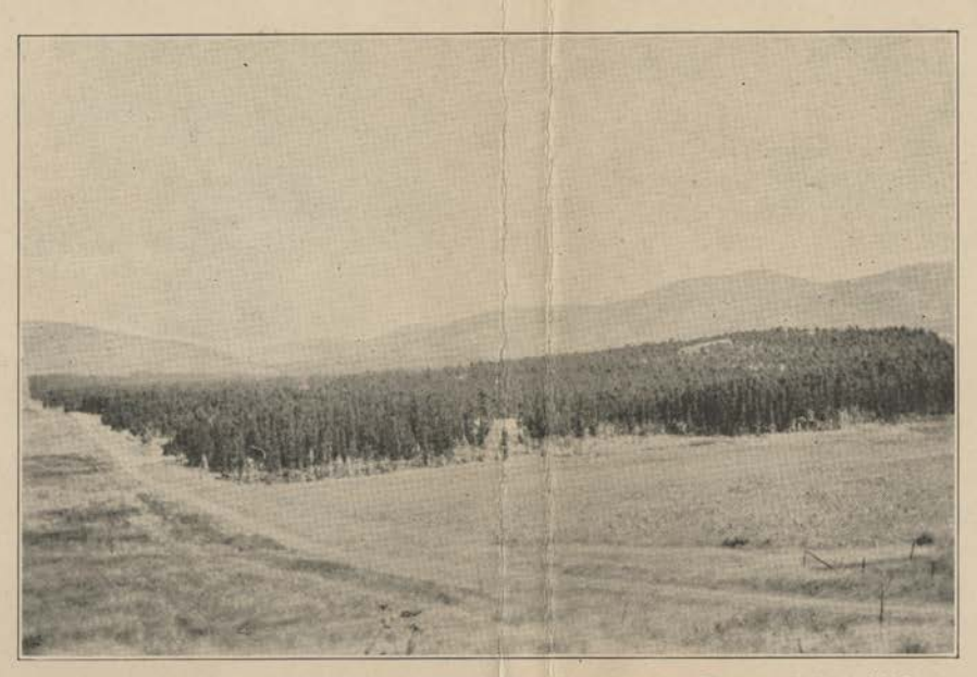
Part of Eucalyptus Culture Company's Plantation. Planted 1909. Photographed Oct. 1914