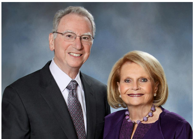
Irwin and Joan Jacobs