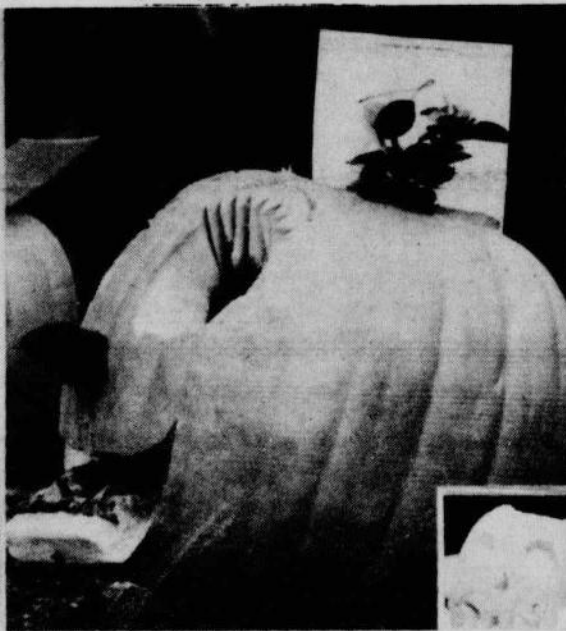
HALLOWEEN FUN AT REVELLE