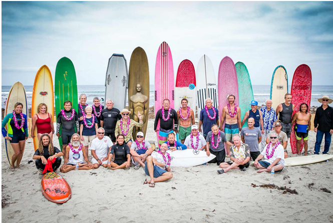
Surfing legends are paired with teams of four for a friendly competition to kick off the UC San Diego fundraiser.

passing 15 years later in 1998. The Sunn Award recognizes medical scientists, philanthropists and community advocates who have made a difference in the battle against cancer and who embody the Aloha spirit.