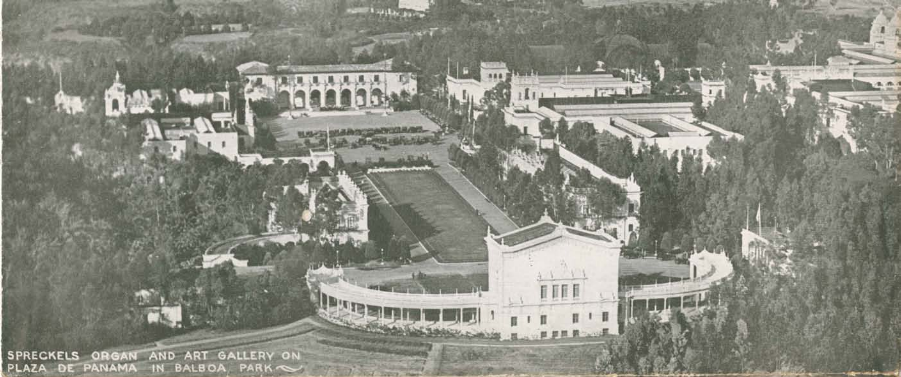
SPRECKELS ORGAN AND ART GALLERY ON PLAZA DE PANAMA IN BALBOA PARK