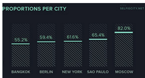
the proportion of selfies featuring women in each city, that the gender imbalance is greatest in Moscow.

For the current phase of the project, the term ‘selfie’ was defined strictly as the photo of one person, taken by the same person using a mobile phone. Using a variety of tools, software developers produced visualizations based on facial recognition data, automated analysis of visual cues, and more.