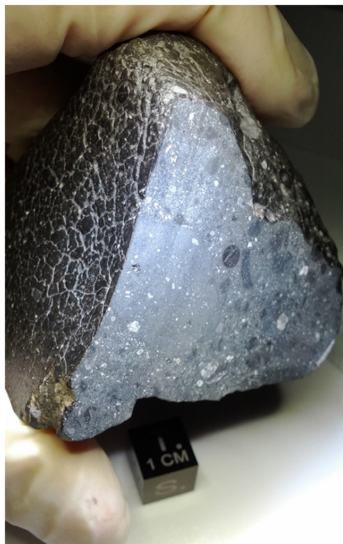
! Mars meteorite is the first linked to the Martian crust.