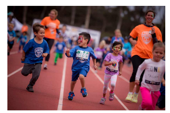
A few "Tritons-in-Training" enjoy the kid-friendly course at Triton Track & Field Stadium.

Early Bird pricing for the Triton 5K is $30 for the UC San Diego community (faculty, staff, alumni and parents of current students); $40 for the general public; $35 for active or veteran military personnel, and $15 for all high school and university students. Day-of registration is