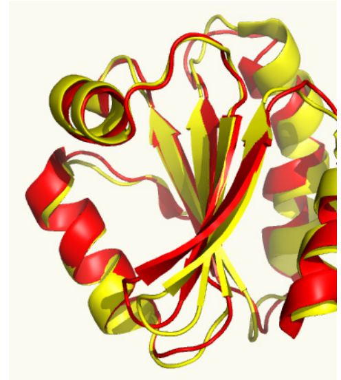
Alignment of the human (red) and fruitfly (yellow) versions protein thioredoxin.

One is the Protein Data Bank, the single world-wide repository for three-dimensional structures of large molecules, based at Rutgers University in New Jersey, and the San Diego Supercomputer Center and Skaggs School of Pharmacy and Pharmaceutical Sciences at UC San Diego. They used the Open Science Grid to compare pairs of proteins, looking for structural similarities that might otherwise have gone unnoticed.