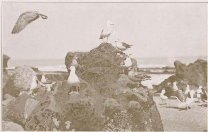
Gulls on the rocks at La Jolla

women of large experience. The school is accredited by the colleges of the east and west and a girl is consequently prepared especially for the institution where she intends to pursue a higher education.