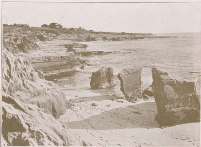
Sea Line at La Jolla