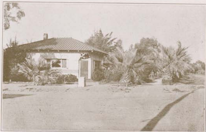
La Jolla Public Library