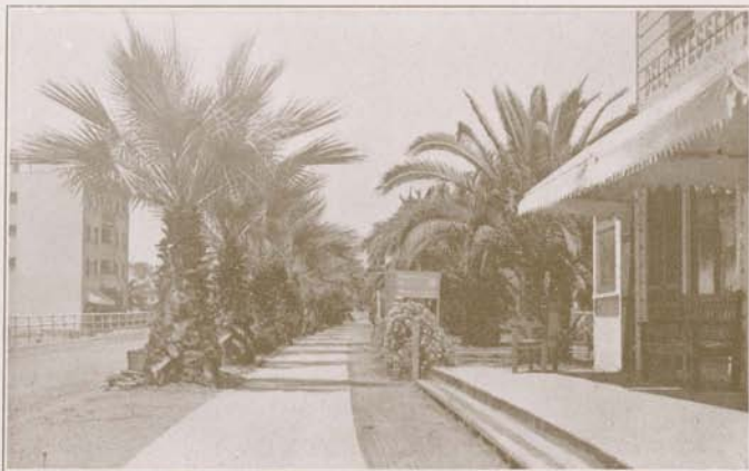
La Jolla Street Scene