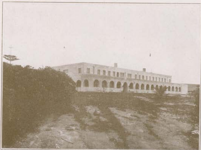
Bishop's School, La Jolla

of the daily papers are also to be found in the reading room.