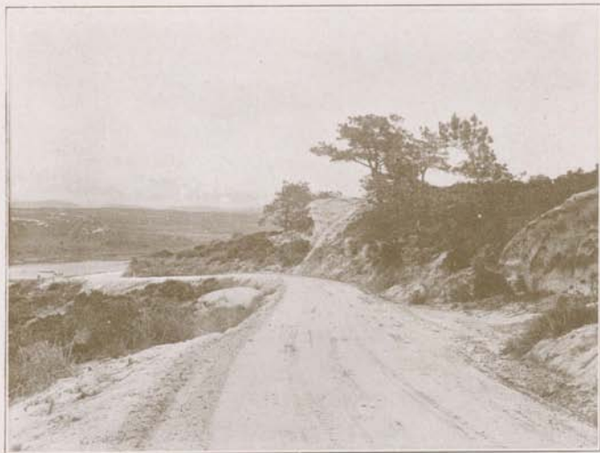
Glimpse of Torrey Pines