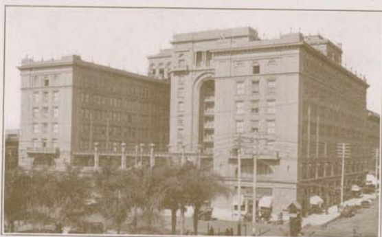
U. S. Grant Hotel, San Diego