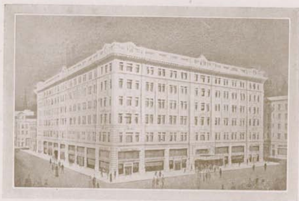
New Spreckels $1,000,000 Theatre, San Diego