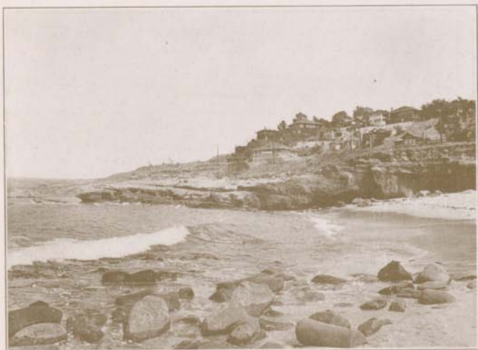
View of Bathing Cove and Cottages