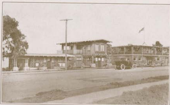
Tryolean Terrace, La Jolla