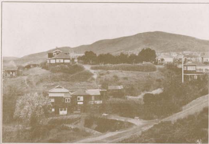
A Rare Combination of Ocean and Mountain Scenery

sand-padded, secluded and sheltered nooks and coves, where bathers may indulge in Neptunal frolics; where the weary may rest and meditate in solitude, and the dreamer may dream undisturbed.