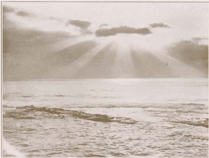
Sunset View, La Jolla