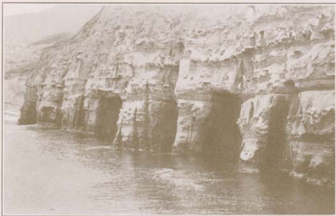
The Caves, La Jolla