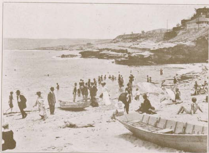
Bathing at La Jolla Beach in Winter