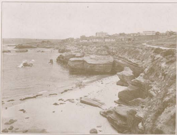
A Bit of La Jolla