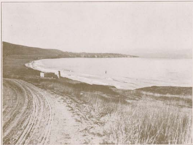
Biological Station, La Jolla