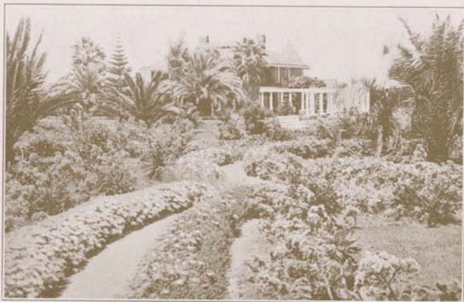
A Winter Scene In La Jolla