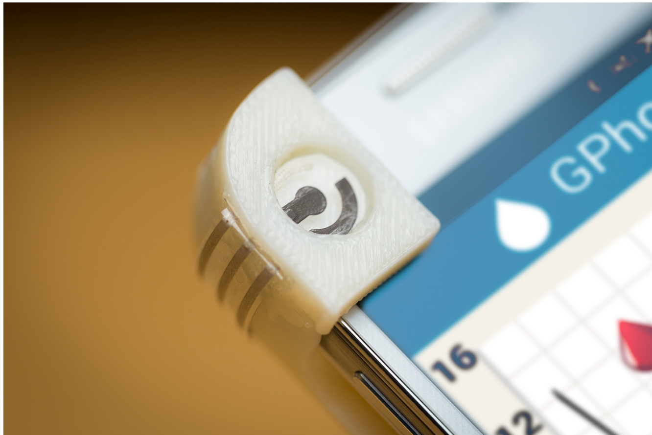
Portable glucose sensing system integrated onto a smartphone