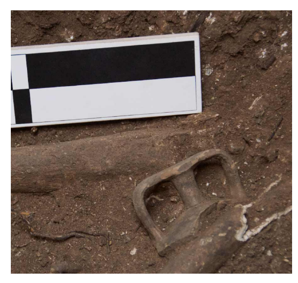
Part of a Mycenaean stirrup jar found with human remains.

Although international trade during the Late Bronze Age is relatively well-understood by archaeologists, little is known about the mysterious smaller "Mycenaean worlds" – the integrated land and sea systems that joined the entire fabric of Mycenaean