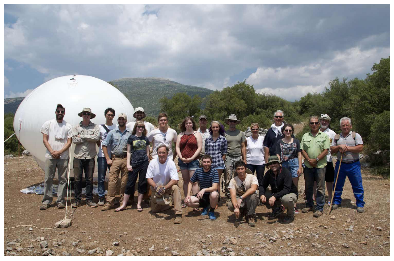
The Kastrouli excavation team

San Diego, Calif., May 17, 2017 — Researchers excavating what was believed to be a completely looted ancient Greek tomb have discovered 15 adult and two juvenile human burials, as well as artifacts dated to a period just before the collapse of Mycenaean society during the late Bronze Age.