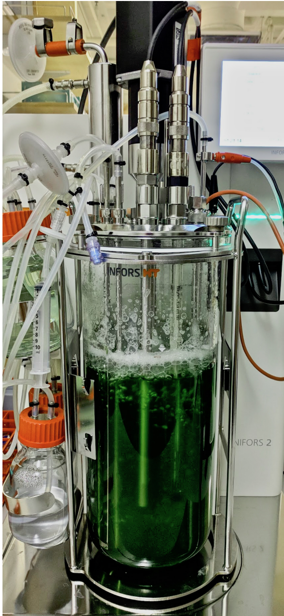
For the human digestion study, algae were grown in a large stainless steel fermentation tank, similar to fermentation tanks seen at beer breweries. A smaller bench-top fermentation tank, or bioreactor, is pictured.