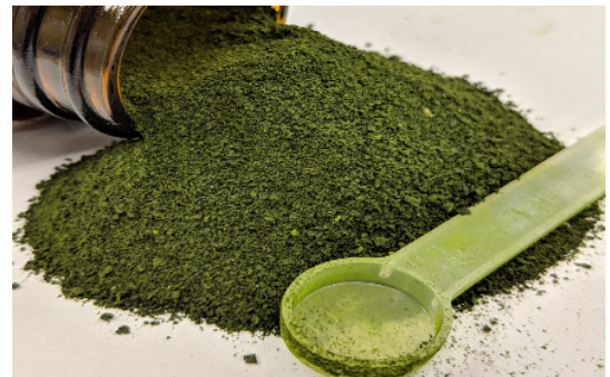
Volunteers in the first study of green algae on human digestion consumed daily spoonfuls of Chlamydomonas reinhardtii algae.

For decades, the green, single-celled organism, which primarily grows in wet soil, has served as a model species for research topics spanning from algae-based biofuels to plant evolution. While other species of algae have been used as dietary nutraceuticals that provide beneficial oils, vitamins, proteins, carbohydrates, antioxidants and fiber, the benefits of consuming C. reinhardtii were previously unexplored.