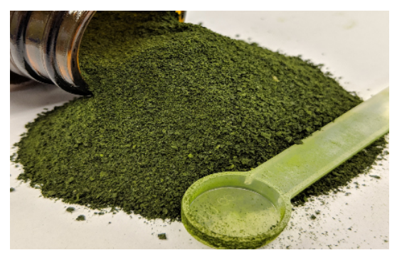
Volunteers in the first study of green algae on human digestion consumed daily spoonfuls of Chlamydomonas reinhardtii algae.

For decades, the green, single-celled organism, which primarily grows in wet soil, has served as a model species for research topics spanning from algae-based biofuels to plant evolution. While other species of algae have been used as dietary nutraceuticals that provide beneficial oils, vitamins, proteins, carbohydrates, antioxidants and fiber, the benefits of consuming C. reinhardtii were previously unexplored.