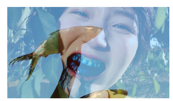
A still from the video installation "Free Fish'es" by Heejung Shin, part of the MFA student's thesis. (Courtesy Heejung Shin)

While studying at UC San Diego, Shin's work centered on the immigrant woman experience, in part using food, gender and language to explore culture from the