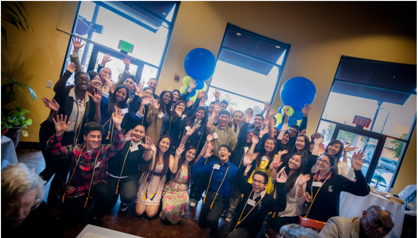
The Chancellor's Associates Scholars Program first launched in 2013 with over 40 students from Gompers Preparatory Academy, Lincoln High School and The Preuss School UCSD.