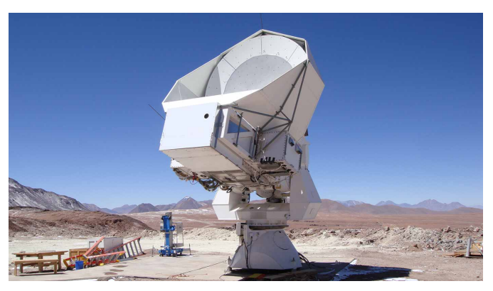
The Simons Array, a system of three powerful telescopes located in Chile's Atacama desert, will give astronomers an important new tool to peer back in time to the early universe.

Led by a team of scientists from UC San Diego, UC Berkeley and the University of Colorado, the Simons Array studies the early universe after the Big Bang