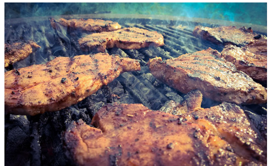
With loss of single gene, red meat-eating humans became more at risk of cardiovascular disease.