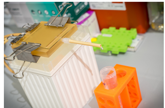
Fluid is pushed through to detach cancer cells from the microfluidic chamber. Slower fluid flow pushes out less sticky cancer cells, which can be collected separately from the more sticky cells.

In the future, the team hopes that clinicians will use this microfluidic device to examine tumor biopsies to estimate the likelihood of metastasis and adjust treatment at earlier disease stages.