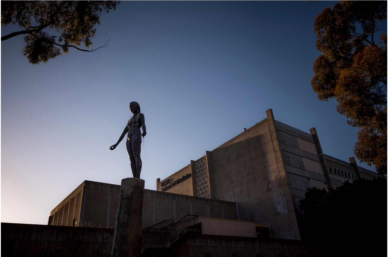
UC San Diego School of Medicine.