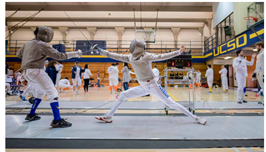
UC San Diego Fencing Team.

The Big West Conference includes four other UC members—University of California, Santa Barbara; University of California, Irvine; University of California, Davis and University of California, Riverside—as well as California Polytechnic State University, San Luis Obispo; Long Beach State University; California State University, Fullerton; California State University, Northridge; and the University of Hawai’i, Manoa. California State University, Bakersfield also received an invitation to join the Big West Conference today.