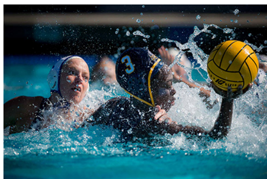
UC San Diego Water Polo Team.

With the transition to Division I, UC San Diego will build upon a solid foundation of academic and athletics excellence, having been consistently ranked among the top seven Division II programs in the country on 11 different occasions in the annual Directors' Cup standings. In 2016, the Tritons placed third in the nation and have twice been named national runner up.