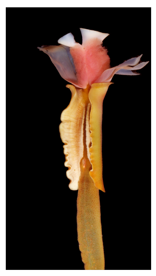
A 'foundation' species of tubeworm found in hot vents an seeps.