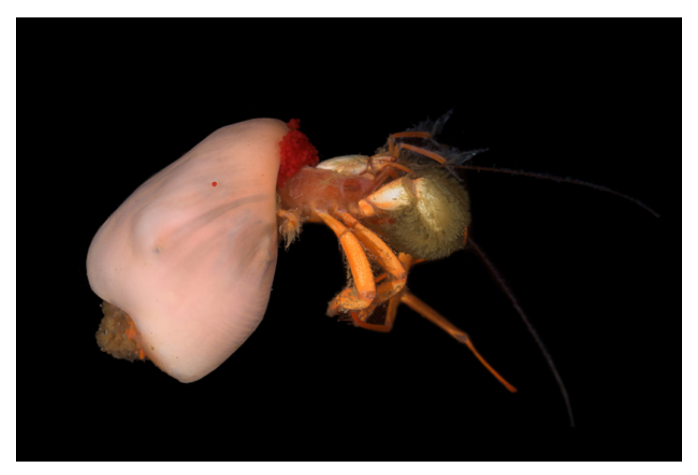
The symbiosis of an anemone and hermit crab in which the crab uses the anemone as a shell.

Researchers discover unknown species at juncture where hot and cold habitats collide