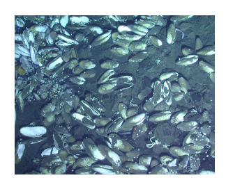
A dense beds of large clams along with snails and crabs.

been visited remotely by other researchers, but it was not until human eyes saw shimmering water coming from beneath a large tubeworm bush that we really understood how special Jaco Scar is."