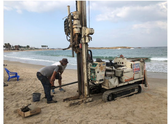
Taking a sediment core from South Bay, Tel Dor, Israel.

The researchers discovered evidence for the tsunami by cutting open sediment cores from their coastal study area at the South Bay of Tel Dor. In these samples, they found an abrupt layer of seashells and sand, dated to between 9,910 and 9,290 years ago, in the middle wetland layers deposited 15,000 to 7,800 years ago. The only way that this marine material could have arrived so far inland, or what would have been inland at that time, the authors determined, was through a destructive wave.