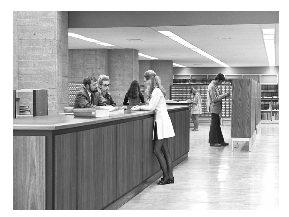
The circulation desk and card catalog at the UC San Diego Central University Library, December 4, 1970.

The Triton community had been teeming with excitement during the construction of the building, which spanned from 1968 to 1970, making the grand opening a much-anticipated event. In fact, the buzz around the university's new library was so great it was helping the institution build its reputation as a place of quality education and innovative research.