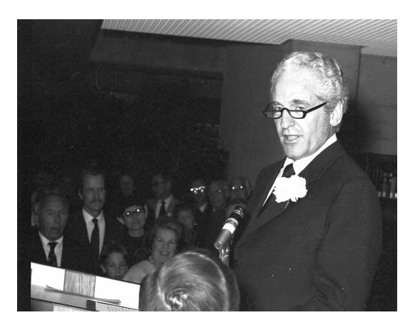
Architect William Pereira.

Many are unaware of Pereira's full body of work, which consists of well over 300 projects, including highly recognizable buildings in each of California's three major cities: San Diego (Geisel Library), San Francisco (Transamerica Pyramid) and Los Angeles (numerous works including the Theme Building at LAX, Los