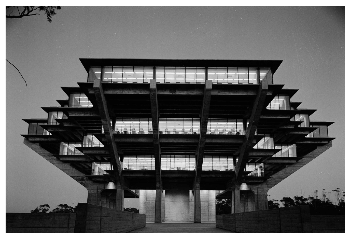
The UC San Diego Central University Library circa October 1970.

C lose your eyes and travel back in time to 1970. Place yourself at the University of California San Diego and take a look around. The campus, only being 10 years new, was just opening its third college and had significantly fewer students, faculty and buildings than today.