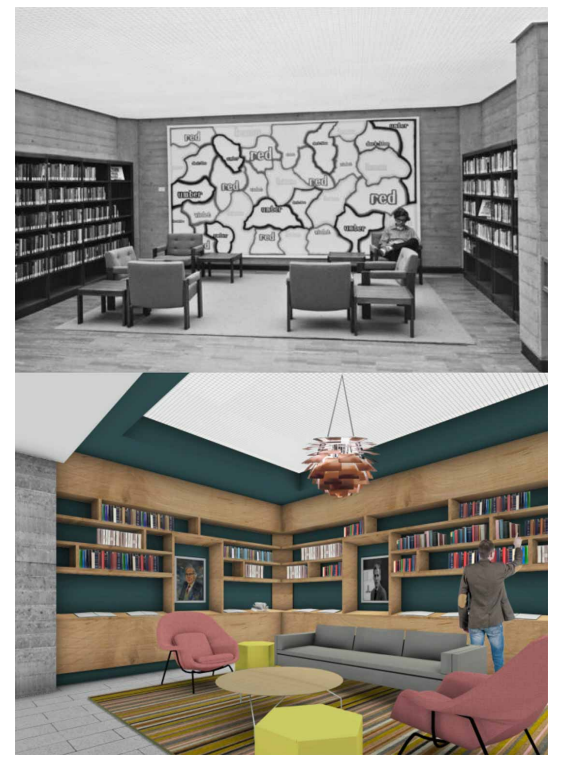
An original photo and future draft rendering of the "meet spot" at Geisel Library. Photo courtesy of the UC San Diego Library and Kevin deFreitas Architects.

Through this project, deFreitas aims to hearken back to many of Pereira's original design elements, including bringing back the reading room that was just inside the main entrance in the 1970s. This space will take on a mid-century modern design aesthetic and serve as a "meet spot" for visitors, allowing them to pause and decide where within the Library they would like to go.