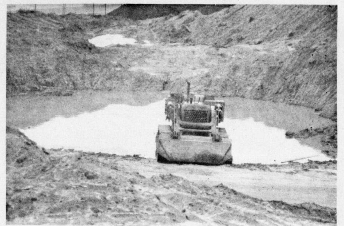
THIS IS one of the reflecting pools left by the rains.