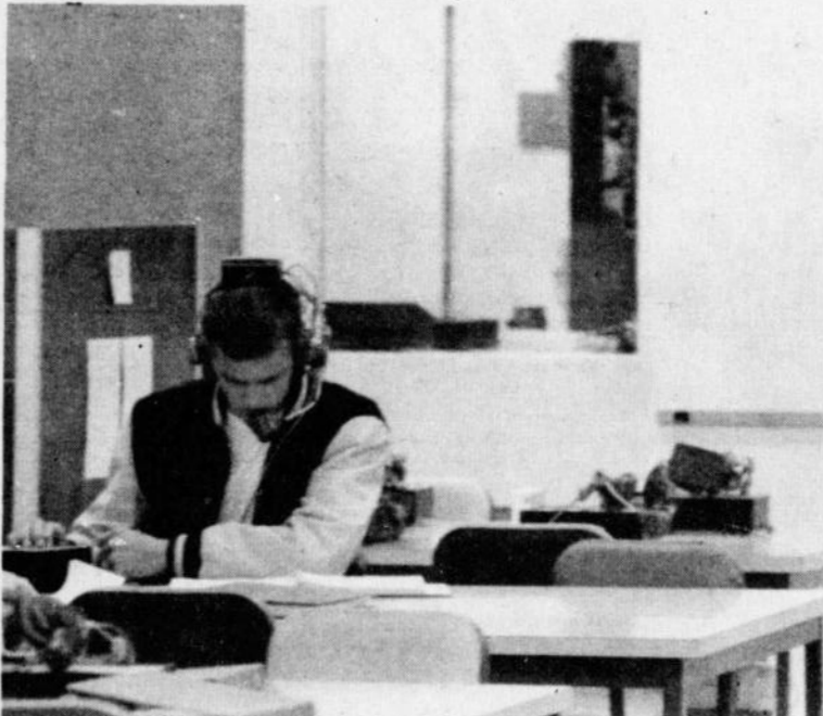
MANY HOURS were spent in the Language Center as students prepared for their tutorials.