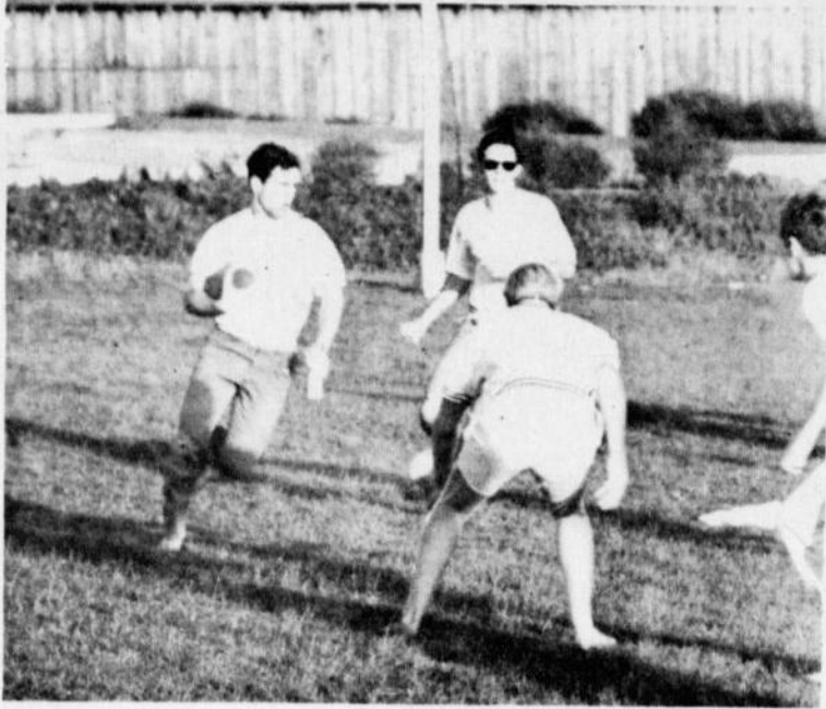
HOT GAME of flag football rages on one of the lovely Camp Matthews fields.