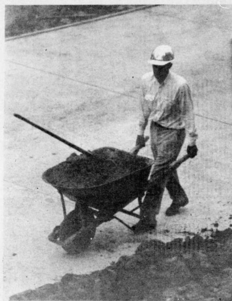
THE OTHER workers at UCSD - the students' busy counterpart steadily works towards completion of the campus.