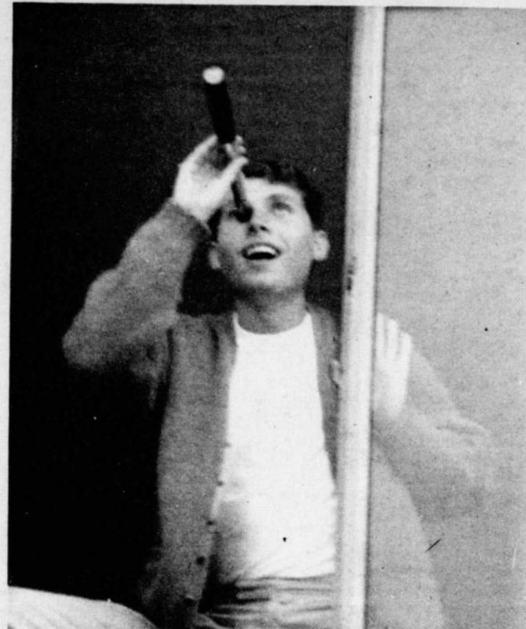
WITH THE ADVENT of see-through curtains in the dorms, a new campus sport of "bird watching" captured male interest.