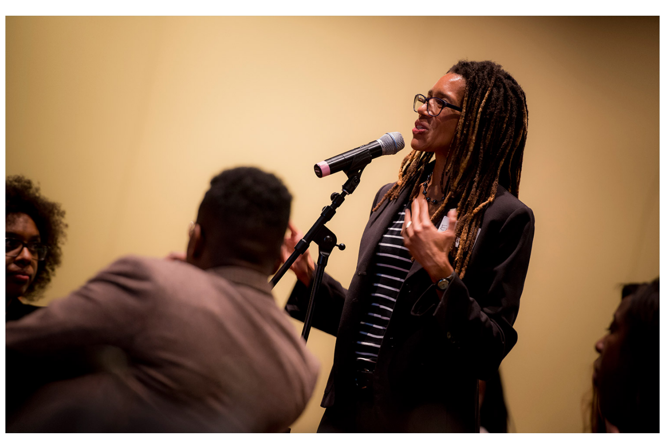
Symposium attendee during the Q&A