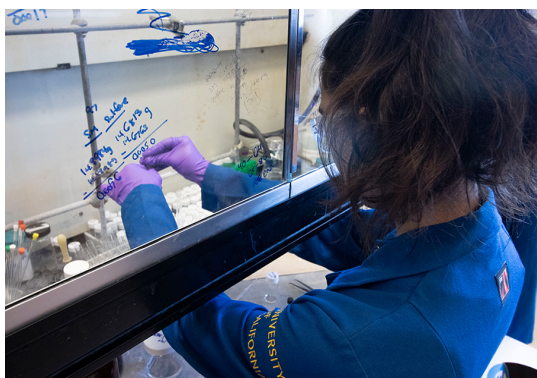
One of the graduate students at work in the Burkart Lab at UC San Diego.