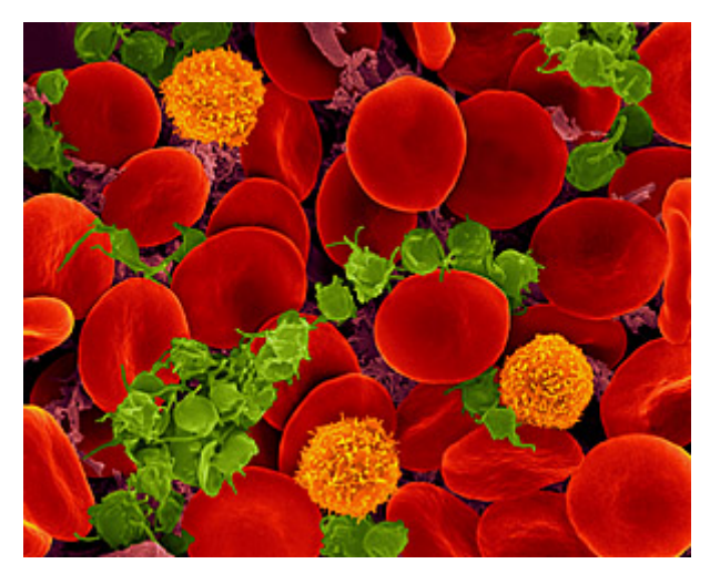
A scanning electron micrograph of human blood with red blood cells, T cells (orange) and platelets (green).

The state-of-the-art facility will be the critical inpatient venue for the delivery of scientific discoveries and compassionate care to cancer patients and their families, and provide the community with a broad array of leading-edge treatments, such as stem cell-directed clinical translational research and T cell therapies that harness a patient's own immune system to attack cancer cells, said Ball.