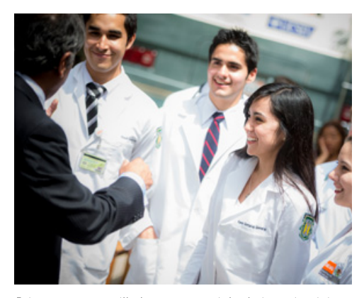
Private support will play an essential role in maintaining c enhancing our research distinction.

Half of all private support given in 2012-13 was designated for research to support the next invention, cure or breakthrough to continue UC San Diego's impact on the community and the world. The campus was recently named 15th best research university in the world by the Centre for Science and Technology Studies of Leiden University, which measures scientific impact of universities worldwide.