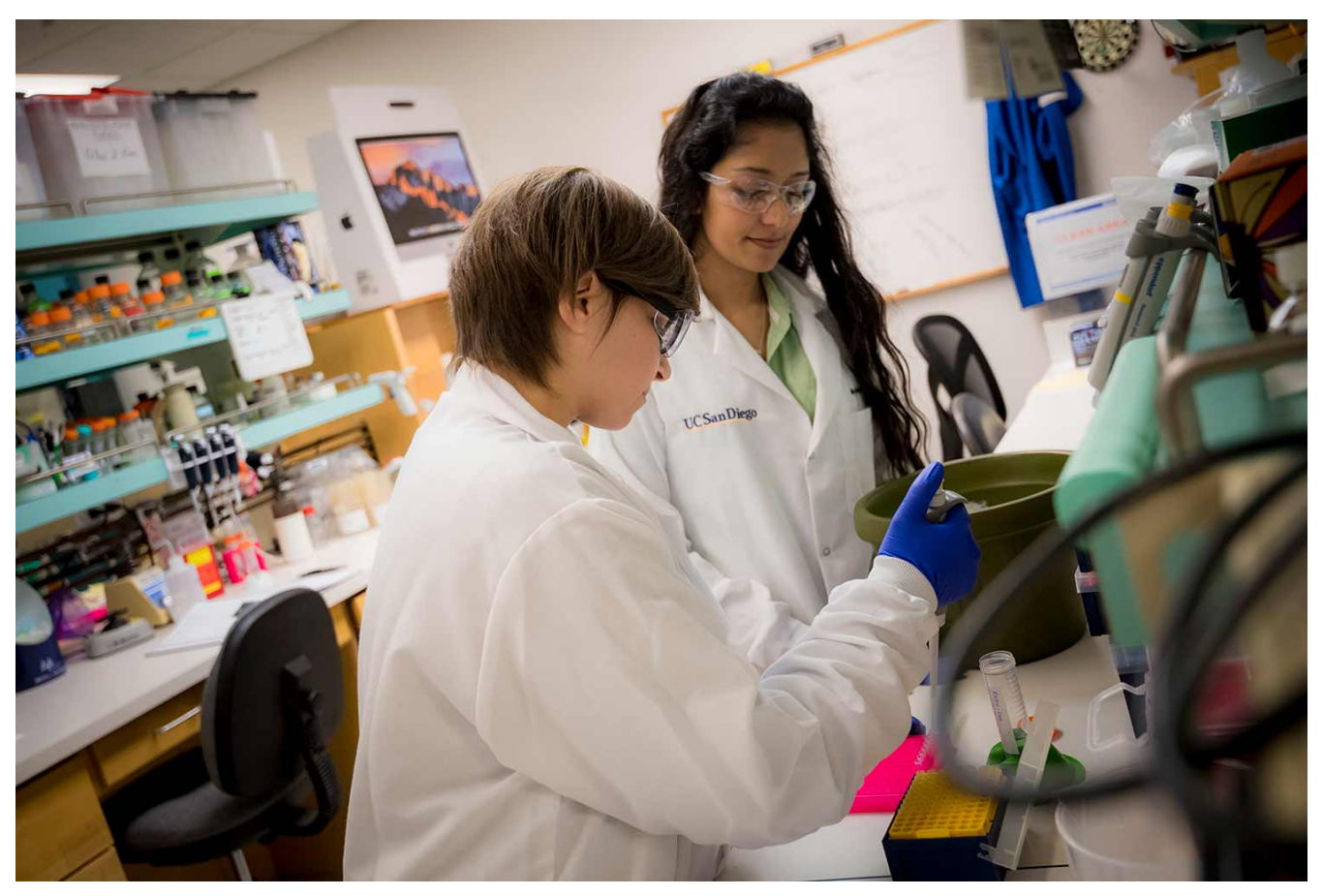
UC San Diego is one of the world's greatest producers of technology, medical innovations and scientific knowledge.