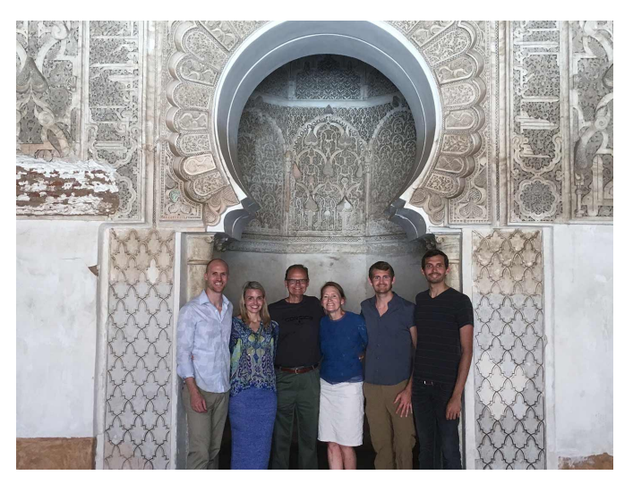
The Reed family is providing generous support to the new Institute for Practical Ethics at UC San Diego.

The institute will host speakers, convene interdisciplinary research groups and create publicly available analysis of cutting edge ethical issues. Until the endowed gift is funded, the Reeds will make annual gifts each year to support some of the envisioned programs.