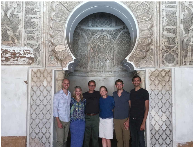
The Reed family is providing generous support to the new Institute for Practical Ethics at UC San Diego.

The institute will host speakers, convene interdisciplinary research groups and create publicly available analysis of cutting edge ethical issues. Until the endowed gift is funded, the Reeds will make annual gifts each year to support some of the envisioned programs.