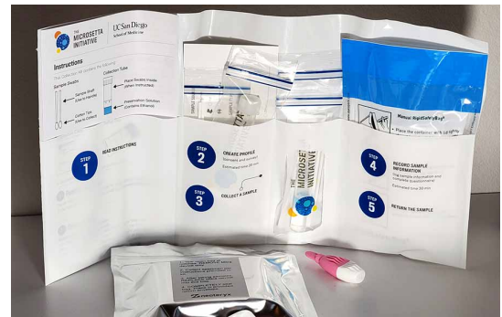
A sample Microsetta Initiative kit