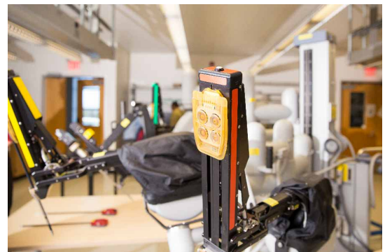
Da Vinci Surgical System

The da Vinci Surgical System is a robotic surgical system designed to perform minimally invasive surgery. The system, developed by the company Intuitive Surgical, is remotely controlled by a surgeon from a console. The system is equipped with four robotic arms, but a surgeon is able to control only two of them at a time. Yip's ARCLab currently has a full da Vinci Surgical System dedicated for research in shared autonomy.