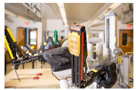
Da Vinci Surgical System

The da Vinci Surgical System is a robotic surgical system designed to perform minimally invasive surgery. The system, developed by the company Intuitive Surgical, is remotely controlled by a surgeon from a console. The system is equipped with four robotic arms, but a surgeon is able to control only two of them at a time. Yip's ARCLab currently has a full da Vinci Surgical System dedicated for research in shared autonomy.