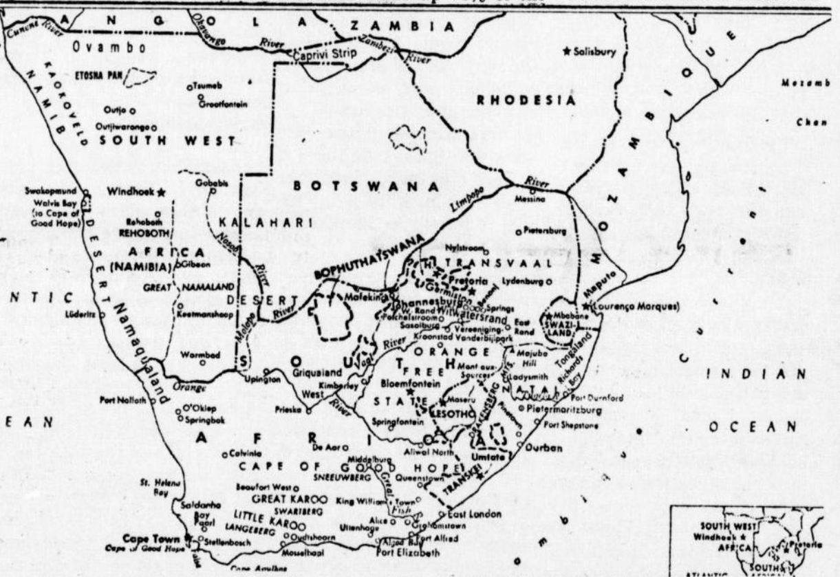
The countries known in the Western world as South Africa, Rhodesia and South West Africa have been given back their African names by the liberation movements in those countries: Azania, Zimbabwe and Namibia. They lie at the extreme south of Africa.

Near cities where there is more work to be done than that of heavy labor as in the mines, Africans live in 'townships',