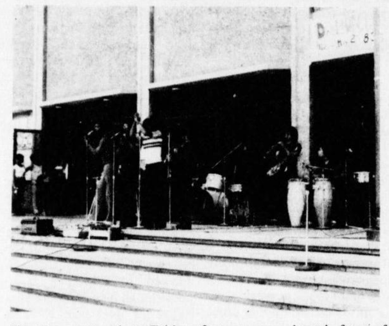
The Force entertains a Friday afternoon crowd out in front of the Gym. Getting mellow with horn and harmony.

fingers poppin', feet stompin', congas. hands clappin', and booties