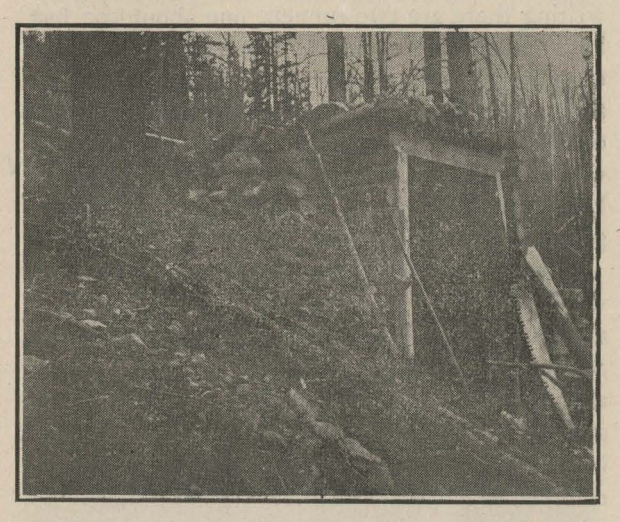
Entrance to the Climax Tunnel (Photographed September 28, 1903, by C. J. Perkins)

on by tunnelling into the mountain side and then running a shaft down to intersect the tunnel. Into this shaft the mountain is shoveled and the ore carried out beneath by a string of cars which run to the mill on an incline. The Alaska Treadwell Company has a milling capacity exceeding 5,000 tons per day and if their ore were as rich as the