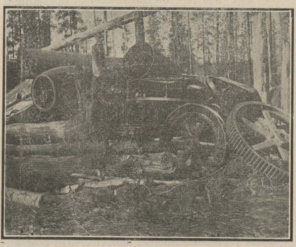
The Climax Company's Steam Hoisting Plant awaiting Pack Transportation at end of New Wagon Road

the fifty stamps which we shall try to get into working next summer, but it is necessary at first to go a little slowly, else the entire capital stock of the company would be spent in getting its first machinery. The day a fifty-stamp mill begins working on the Climax Mine there will be no stock for sale at less than $2.00 per share, and probably not at that.