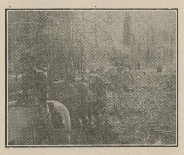
Pack Train just arriving at the Climax Mine

The Climax takes rank with the big properties which are not selling stock because the men who