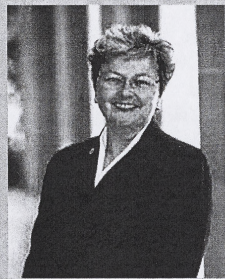
Executive Director. California Plug-In Vehicle Collaborative and former State Senator

DO YOU CARE ABOUT EQUAL PAY, FAMILY LEAVE POLICIES. FEDERAL RESEARCH FUNDING, AND THE QUALITY OF FDUCATION?