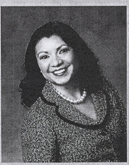
National City Vice Mayor and Development Director, MANA, UCSD Class of 2001, and former director of the UCSD Community Law Project

Government plays an important role in all of these initiatives that impact your life. Women need to actively participate in order to insure that their interests are listened to.